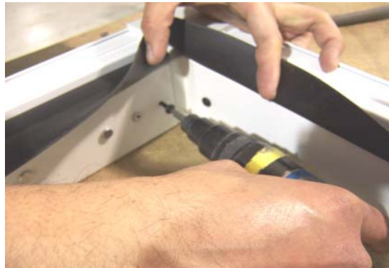
Step Four: Place a screw into the pre-punched hole in the jamb.