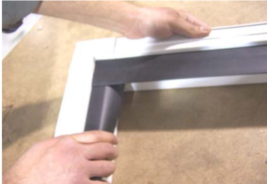
Step Three: Make sure the corner is fully inserted and the wipe is not in the way.