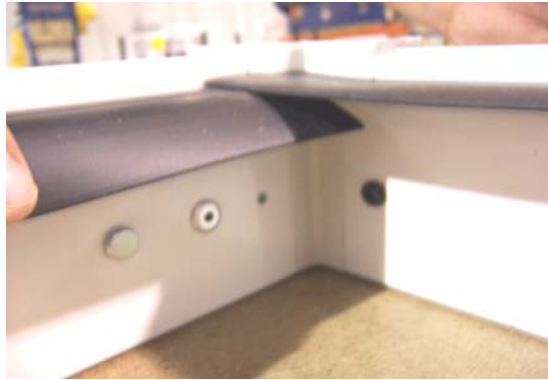
Step Two: Insert the cast corner piece into the open jamb.