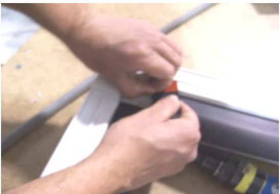
Step Five: Treat the area of wipe with alcohol and primer and remove the tape backer.