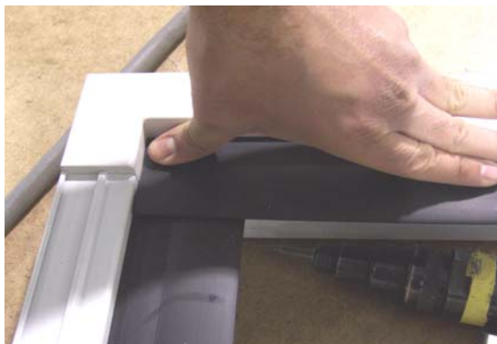
Step Six: Press down firmly to securely seal the tape to the cast corner.