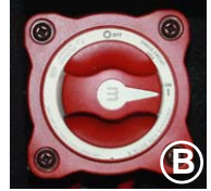
Fig. 2 - (B) ON