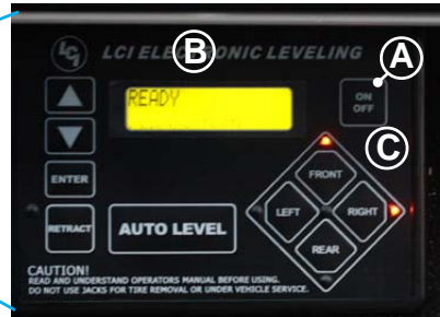
FIG. 4 - Touch Panel