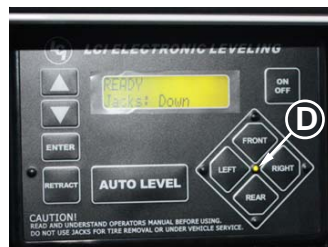
FIG. 5 Touch Panel - Unit Level