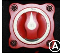
FIG. 2 - (A) Off