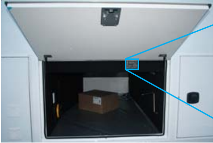
FIG. 3 - Storage Compartment - Note location of touch panel.