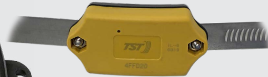
INTERNAL SENSOR Securely mounted inside the wheel/tire assembly