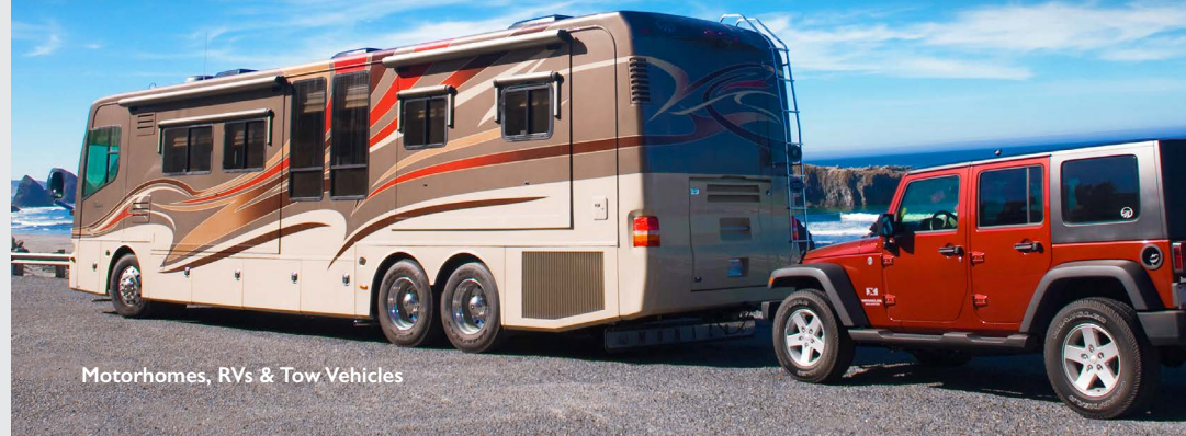
Motorhomes, RVs & Tow Vehicles