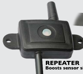
REPEATER Boosts sensor signal to display