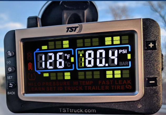
TST WIDE-SCREEN COLOR DISPLAY Real-time alerts for Tire Pressure and Temperature

Increased awareness brings increased safety, tire life and fuel economy.