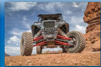
Side-by-sides, ATVs & other Toys!