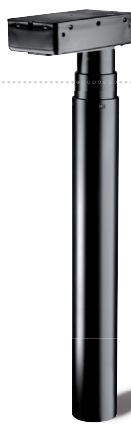
DL11 or DL11XL column